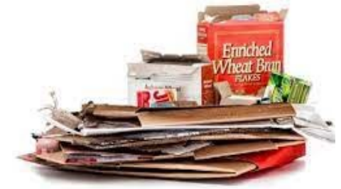
Paper, Flattened Cardboard & Paperboard