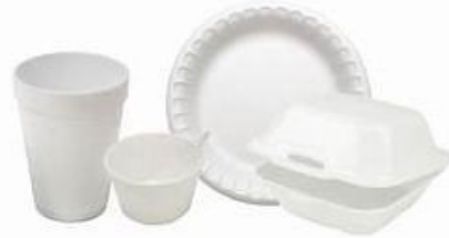
Food & Beverage Containers