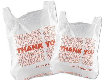
Plastic Bags & Containers