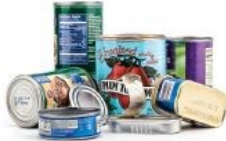
Food & Beverage Cans